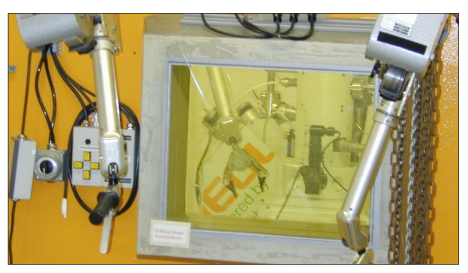
Figure 4: Shielded EPMA