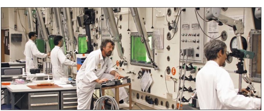
Figure 3: Hot Laboratory hot cells.