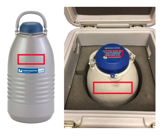
Figure 3: Locations of dewar name tags

2. Make sure the dewars are CLEARLY LABELED (on the side and the lid) with the exact name noted in the spreadsheet.