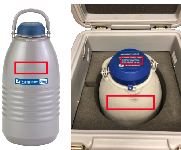
Figure 3: Locations of dewar name tags