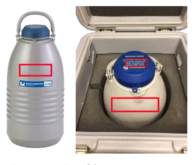
Figure 3: Locations of dewar name tags

2. Make sure the dewars are CLEARLY LABELED (on the side and the lid) with the exact name noted in the spreadsheet.