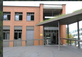
PSI Education Centre