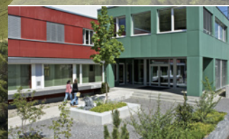
Center for Proton Therapy