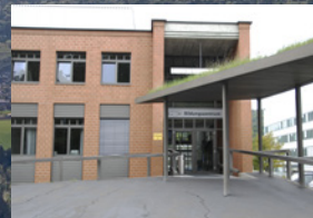
PSI Education Centre