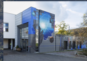
PSI Visitor Center