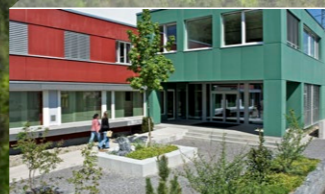
Center for Proton Therapy