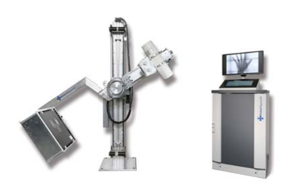
Demonstrator system. Our detector is on the bottom left.

WHO. First WHO Global Forum on Medical Devices: [1]context, outcomes, and future actions. Tech. rep. WHO, 2011. URL: http://is.gd/qDMekI.