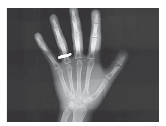
First image of a hand phantom acquired with the GlobalDiagnostiX detector prototype.