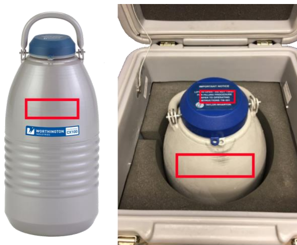
Figure 3: Locations of dewar name tags