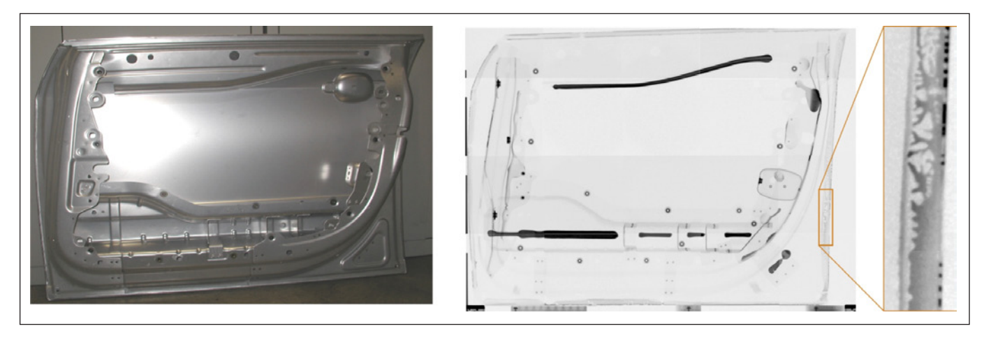
Example 3: Assembly of a car door: Left: Photograph; Right: Neutron radiography, showing the quality of the adhesives layer.

Tomography data can be obtained with the same setup. Using the principles of computed tomography, a full 3D animation of any object can be gained from a series of parallel 2D projections. The object is placed on a rotating base and turned in small incremental angular steps over 180°, to be irradiated from many different directions.