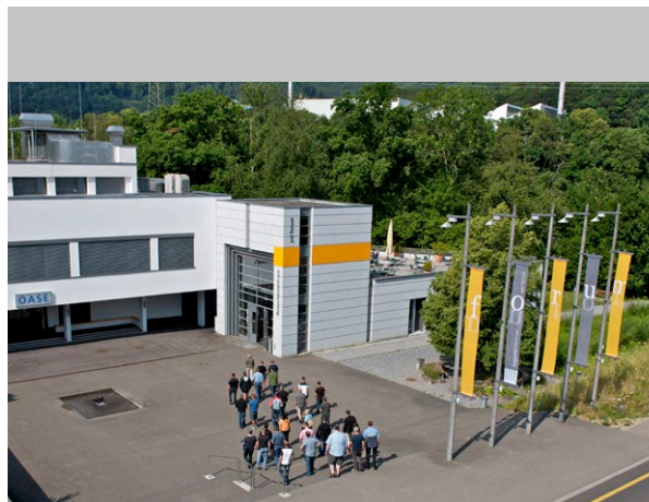
Visitor Centre psi forum